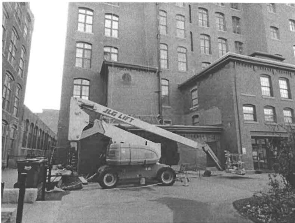
Photograph 1 – Work underway on the lower wall areas.