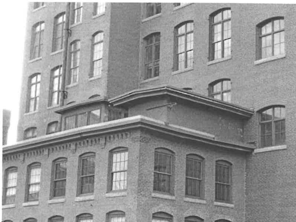
Photograph 4 – The penthouse walls above the lower roof to be included in the painting quote.